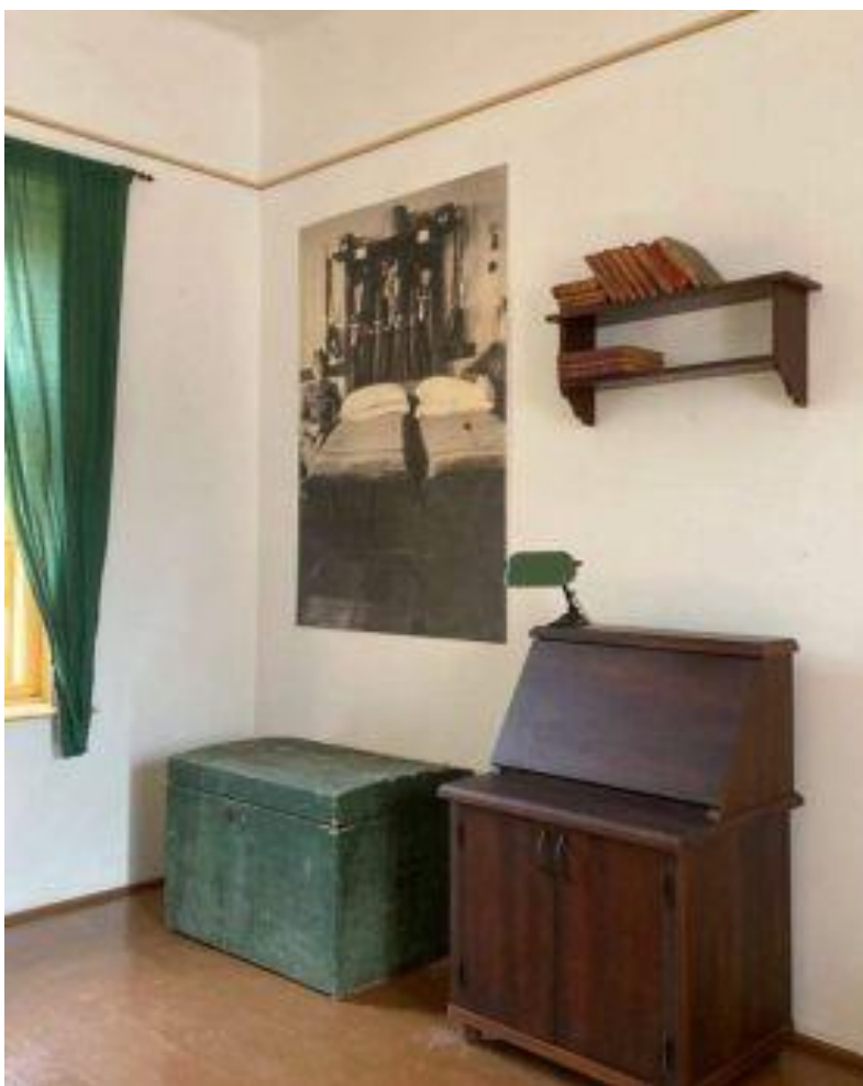
A section of the bedroom side of the gendarme garrison exhibit.