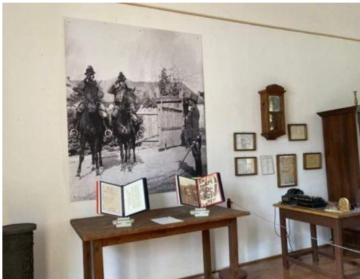
A portion of the ÓNTE gendarme exhibit's office side with the swinging panel displays. This table will also house the books the visitors may browse on site.

We also made some minor changes in the arrangement of the exhibit's furniture to make it more authentic, and we placed two large wallpaper images on the walls to improve the visitors' experience. Above the aforementioned table outside the cordon is a wall picture of two gendarmes on horses, about to start their patrol. On the opposite wall is a picture of two gendarmes resting on their bedside chairs, which was the only private place they had. They