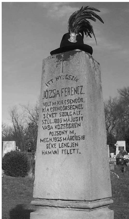
The csendőr's gravestone restored by the three young men in Rétság, Nógrád megye