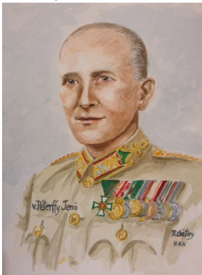
Gendarme Col. Jenő v. Péterffy.

The gendarmerie went on to serve our nation with the same spirit and dedication after 1918. They continued their disposition even after 1945 during the purges inflicted on them by the communist state. Those that managed to emigrate abroad, exemplified this same dedication. Their love and commitment to their past service led them over many years to meticulously collect and preserve their cherished gendarme artifacts for a hoped-for gendarme museum or permanent exhibit in Hungary, sometime in the future. The collection was thus eventually transferred home