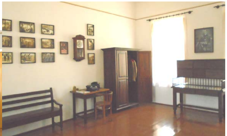
The side of the garrison's office.

At the entrance of the exhibit is a reproduction enameled gendarme sign as was found at the entrance of all the former garrisons. Because we only have one room to work with, the room was divided into two sections: the left side depicts the garrison office, and the right side represents the gendarme berthing and common space area. The office portion contains a built-to-specifications desk and cabinet. The right side has a made-to-specifications bed, desk, cabinet, and hanger/shelf on which were placed the uniforms, great coat, hat, rifle, sword, and other equipment. On the walls are thirty